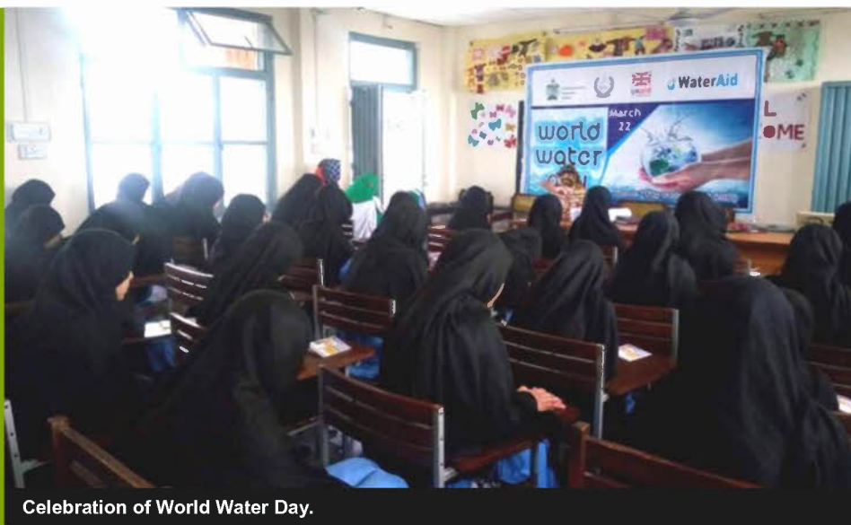
Celebration of World Water Day.

The students, teachers and GWP-EPS staff celebrated the day by doing paintings, writing debates, and sketches competition and speeches about the importance of the day. Water stands at the heart of the new 2030 agenda for sustainable development. At the end of the event all the participants vowed to conserve the water by standing consolidated not only with those 38.7 million of Pakistanis who lack access to clean and safe drinking water but all those 7.83 billion people across the world who are deprived of this exquisite natural gift.