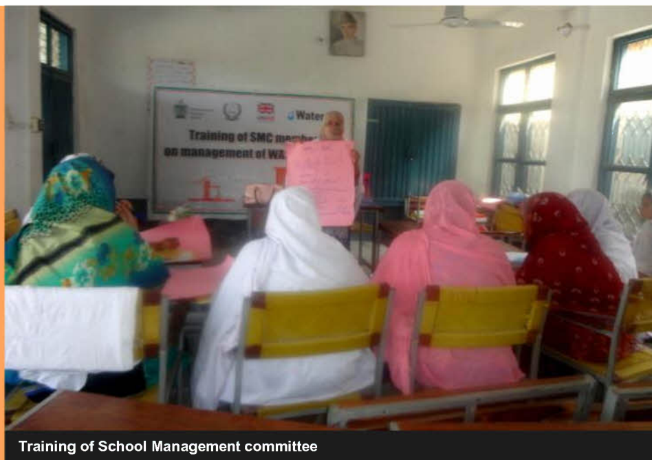
Training of School Management committee

In this regard, 5 numbers of Trainings were conducted with the SMC members of the targeted 60 schools from July to September, 2017. Training were facilitated by the female Hygiene Promoters of EPS Team and monitored by M&E Officer, EPS.