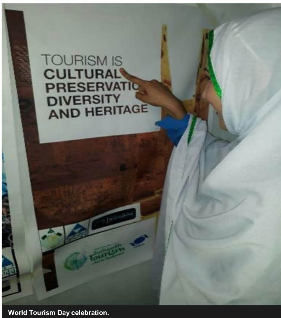
World Tourism Day celebration.