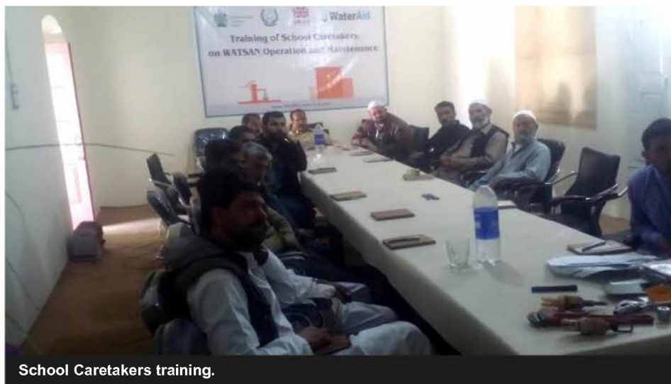
School Caretakers training.

Two Trainings were imparted to the caretakers of the targeted schools on the Operation & Maintenance of WATSAN services on 26 March 2017 and 31 st March 2017. Care takers from all the targeted 30 schools participated in these trainings. The overall aim of operation and maintenance is to ensure efficiency, effectiveness and sustainability of water supply and sanitation facilities. It is required to ensure the sustainability of any project in which a new infrastructure has been put into place. These training ensures that the project is sustainable in a long-term and allow for the correct provision of services and benefit of end-users. It also prevents the systems to collapse creating environmental and health hazards. This training helped in practical involvement of school caretakers in operation & maintenance of constructed/rehabilitated schemes.