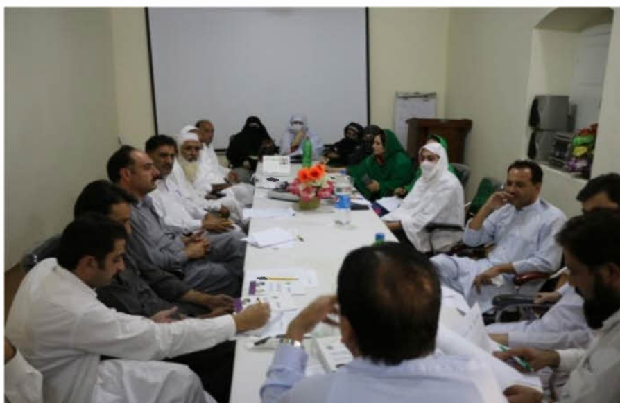
Consultative workshop at Peshawar.