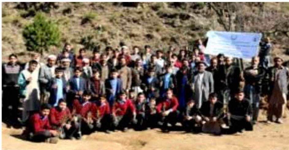
National Green Day Celebration.

Forest Department representatives mentioned in their speeches that we have provision of free plants to community for which many community requests were handed over to them and were entertained. At the end of the ceremony, plantation campaign of 1000 plants containing pine, acacia (kikar) and Eucalyptus species was carried out. 1000 plants were planted on the same day (February 09, 2017).