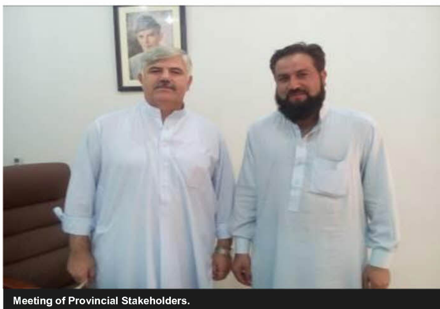
Meeting of Provincial Stakeholders.