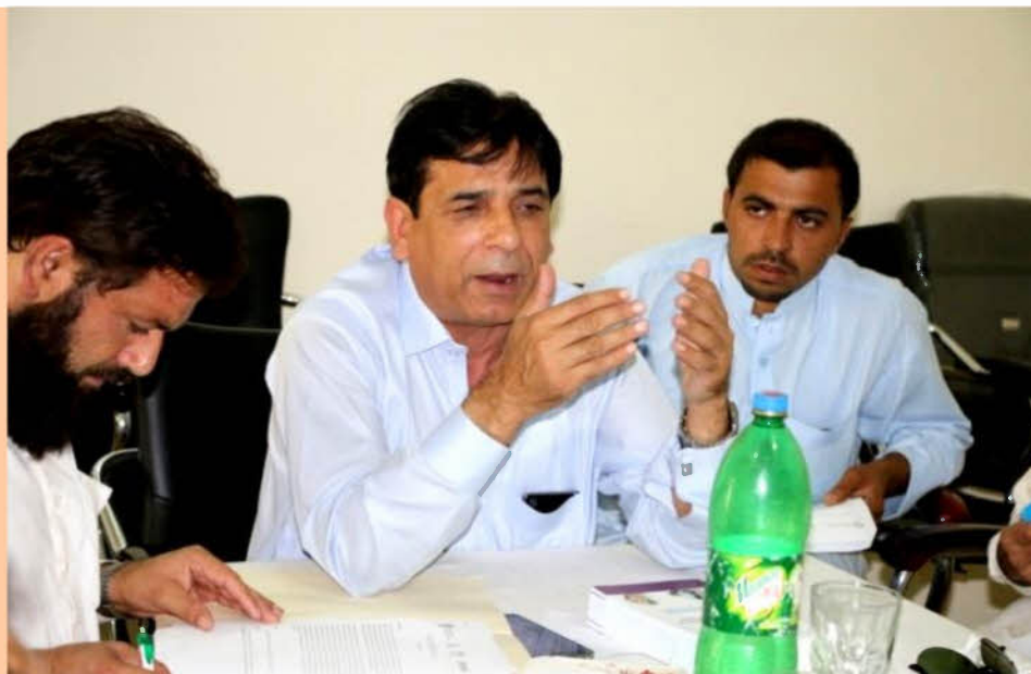
District WASH forum meeting.

To establish an effective and functional Forum, the meetings of the District WASH Forum were conducted on quarterly basis.