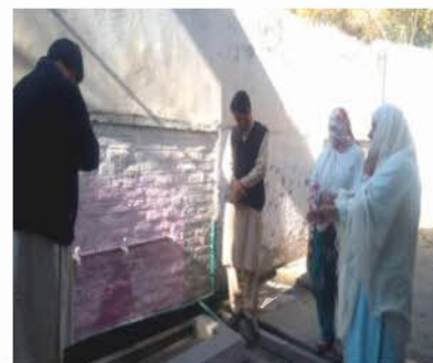
Monitoring and certifications visits.

Visit of the members was envisioned to see the sites which were either constructed, rehabilitated or still under construction and to ensure transparency and accountability of the interventions by EPS & WaterAid in Pakistan. After the visits the DWF members certified the WASH services and also presented their recommendations for further improvements.