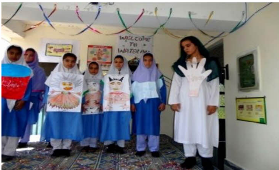
Public awareness raising campaigns.

Seven events on hand washing were conducted in Year 3 targeted schools. These events comprise of Speeches on advantages and disadvantages of hand washing, skits regarding hand washing importance, poems on hand washing, practical demonstration regarding hand washing and cleanliness. Drawing competitions regarding hand washing at critical times were also conducted in these schools.