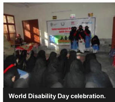
World Disability Day celebration.

At the end of the event EPS staff urged all the students to feel the true emotions of people with disabilities to achieve the best of their skills in the practical life. At the ending of program EPS staff highly appreciated the efforts of principle and students and thanks the whole staff of the school and prizes were also distributed among students for encouragements. The participants adopted participatory approach and participated fully in the session and also thanked the team of EPS & acknowledged their efforts.