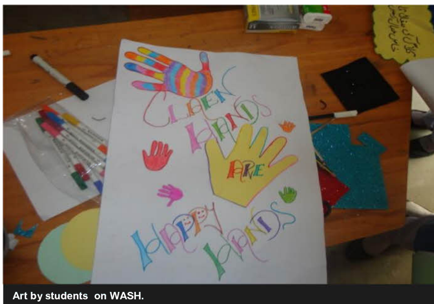
Art by students on WASH.