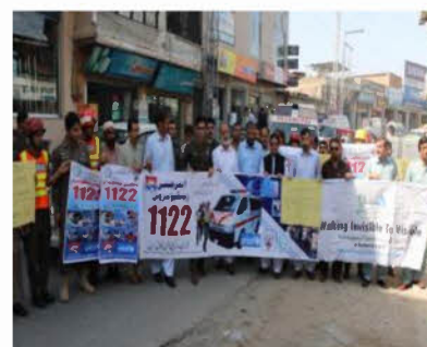
Natural Disaster Day Celebration