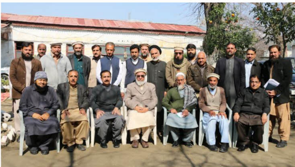
General Body Members